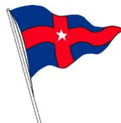
New York Yacht Club